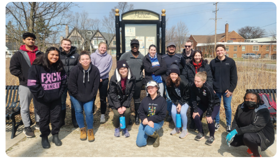
Students in BIO 351 commit to service.