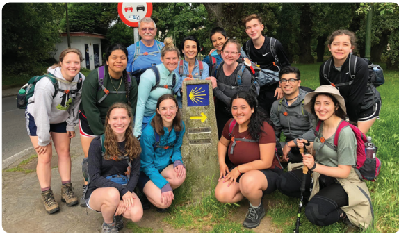
Elm U students find ways to be of service while studying in Spain.