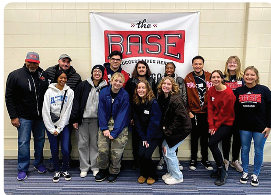
Digital Media students use their skill to serve The BASE in Chicago.

by Jeremy Renner himself – an actual Avenger!